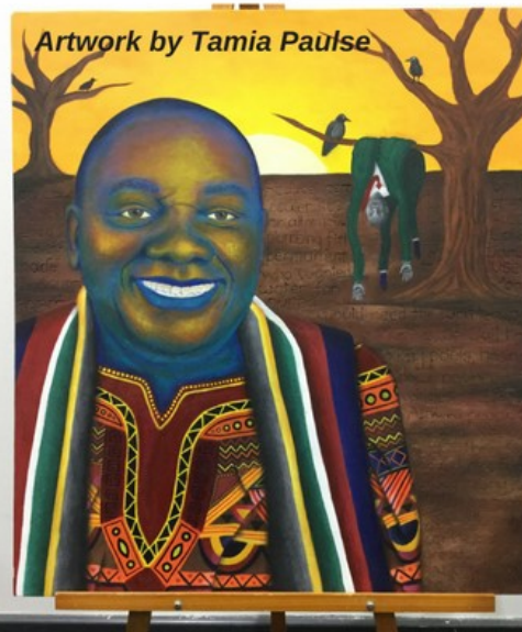
Artwork by Tamia Paulse