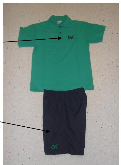
CVC Sports Shorts – Green Logo