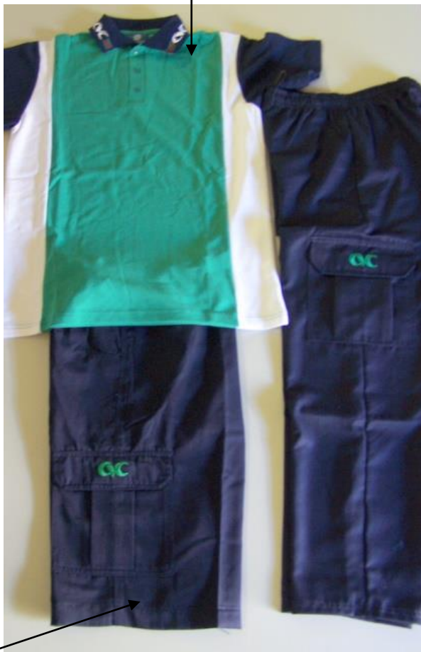
Cargo Shorts - CVC Logo