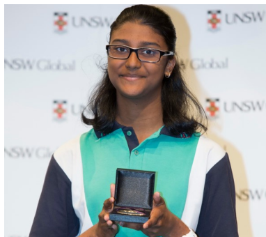
NSW ICAS Medalist achieved in the top 1% of Yr 8 Participants in ICAS Writing Competition