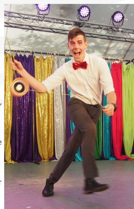
Year 12 2018 student awarded School Curriculum and Standards Authority 'VET Certificate of Excellence in Creative Industries' award