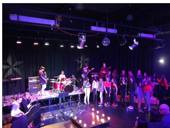
Year 8-10 vocal music students and house band perform to family and friends