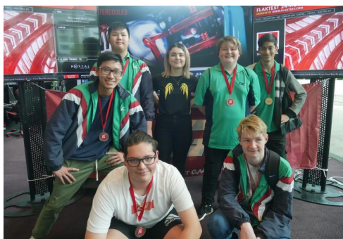
Esports gaming team CVC Overwatch crowned 2018 Regional League National Champions